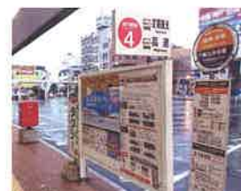
Beppu Sta. East Exit (Beppu Ekimae 4) Regular Sightseeing Bus stop