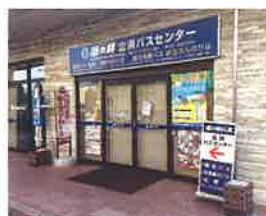
Kamenoi Bus Kitahama Bus Center