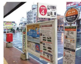
Beppu Sta. East Exit (Beppu Ekimae 4) Regular Sightseeing Bus stop