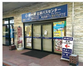
Kamenoi Bus Kitahama Bus Center