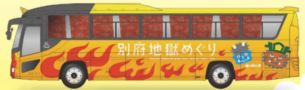
* The bus in use may change due to maintenance, etc.

The first course in Japan to feature a female bus guide